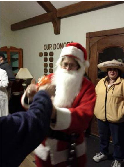
Santa made a cameo appearance at the Halloween tour.