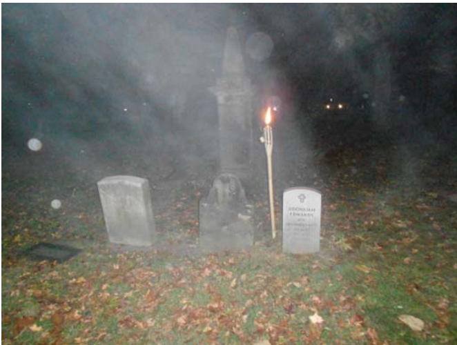
People always ask us about whether or not we get visits from some of our permanent residents. The picture taken by the Edwards monument during one of the tours seems to suggest we had some visitors.